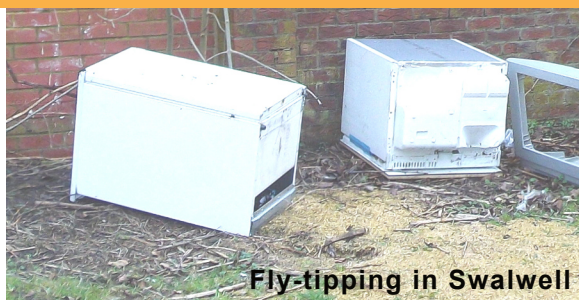
Fly-tipping in Swalwell