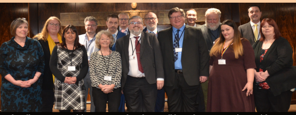
The Lib Dem opposition on Gateshead Council have been surveying residents.

The 17 Liberal Democrat councillors in Gateshead have been talking and listening to residents about what needs to change with the way the Council is being run.