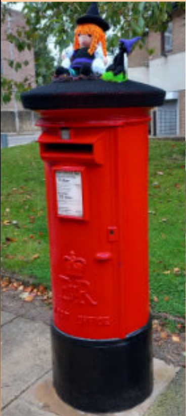
Above: A Halloween theme and Top right: Remembrance Day topper