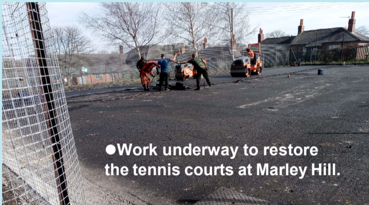
●Work underway to restore the tennis courts at Marley Hill.

The two tennis courts at Marley Hill are being restored and brought back into use thanks to a grant from the Lawn Tennis Association.