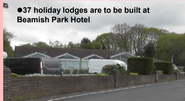
●37 holiday lodges are to be built at Beamish Park Hotel